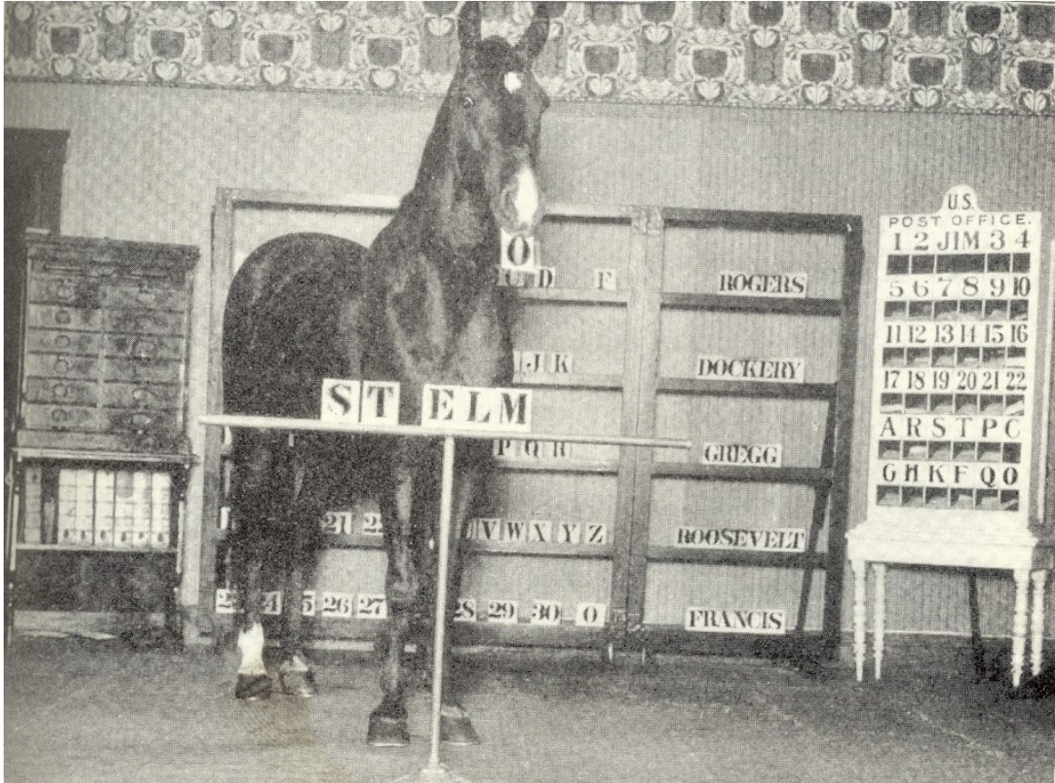
Beautiful Jim Key on stage with his letters and numbers